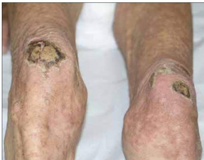
Figure 2. Hyperkeratotic plaques on the extensor surfaces of the knees on a diffuse background of erythematous, scaly, excoriated, and somewhat lichenoid papules

microscopy for making a definitive diagnosis (1). Epiluminescence microscopy/dermoscopy may also be useful diagnostic adjuncts. Besides light microscopy and dermoscopy, S. scabiei can be visualized using reflectance confocal microscopy (RCM), which is an imaging modality that allows in vivo examination of the skin at a resolution similar to that used during histopathology (2, 4, 5). As a light source, this technique employs a diode laser and combines the advantage of being non-invasive with the ability to study dynamic events occurring within various layers of the skin. Detection of S. scabiei using RCM has been described by some authors in the literature (4-11). However, to the best of our knowledge, the examination of S. scabiei with RCM in real-time video format has not been reported in Turkey. Here we report the case of a patient with crusted scabies and demonstrate a brief portion of the lifecycle of the ectoparasite.