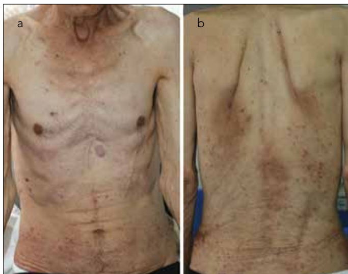
Figure 1. a-b. Numerous excoriated erythematous papules on the anterior (a) and posterior (b) aspect of the trunk