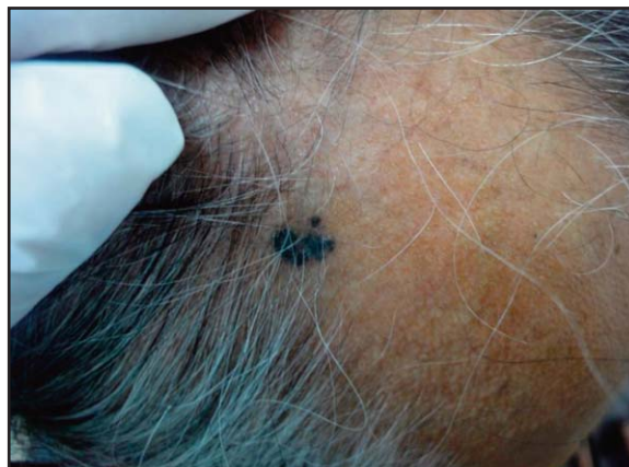
Figure 3. Pigmented basal cell carcinomas in anterior scalp