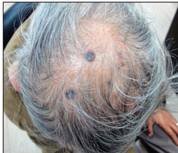
Figure 1. Multiple pigmented basal cell carcinomas in the scalp

Multiple BCCs are often linked to some genodermatosis, including Gorlin syndrome and xeroderma pigmentosum. A nonsyndromic type of hereditary multiple BCC was postulated recently [4].