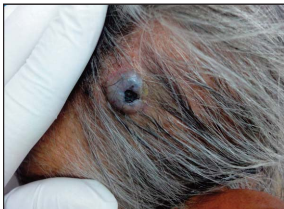
Figure 2. Pigmented nodulocystic basal cell carcinomas in scalp