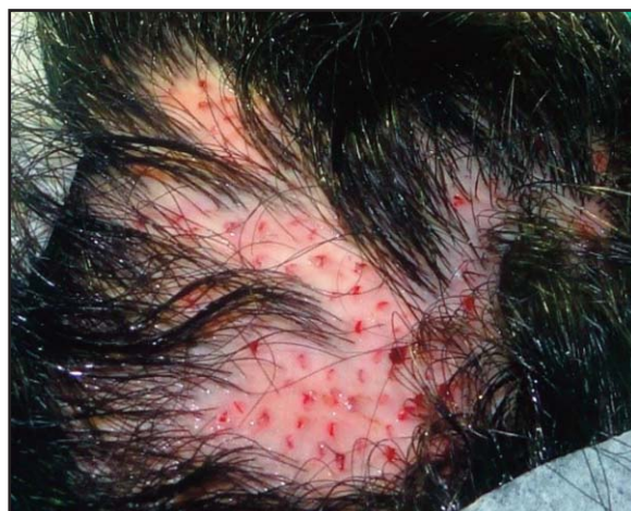
Figure 2. Implanted follicular units into the bottom of the micro-slot