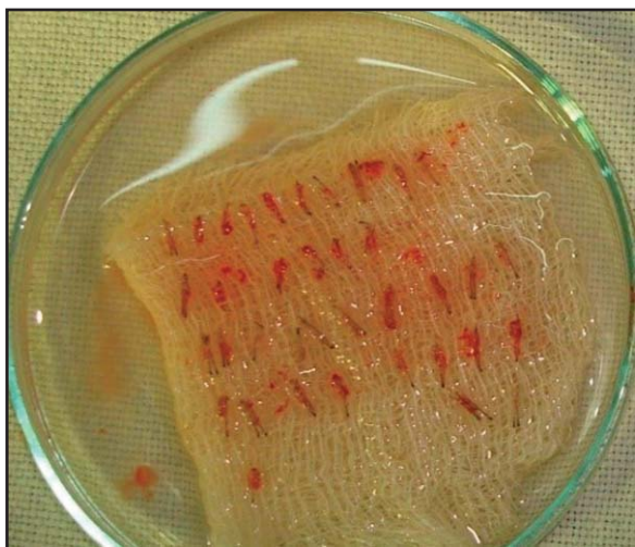
Figure 1. A series of follicular -units