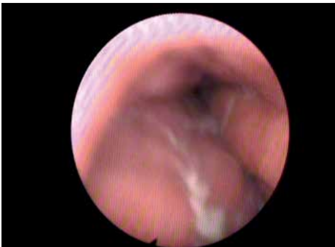
Figure 2. Endoscopic view of the abscess

the airway and subsequently draining the abscess under general anesthesia was last decision. However, patient did not conform to the tracheotomy; therefore, it was decided to try intubation in awake condition. After urgent tracheotomy preparations, the patient was intubated by anesthesia team with the help of flexible endoscopy in awake condition. Abscess (approximately 150 cc pus) was drained (Figure 3). Nasogastric probe was placed for feeding and decided not to extubate for edema in airway to pass. Two days after the operation, the patient was smoothly extubated, oral feeding was started, and general state and blood values had improved. Six days after the operation, the patient was discharged from the hospital. Consent form was taken from the patient for this paper.