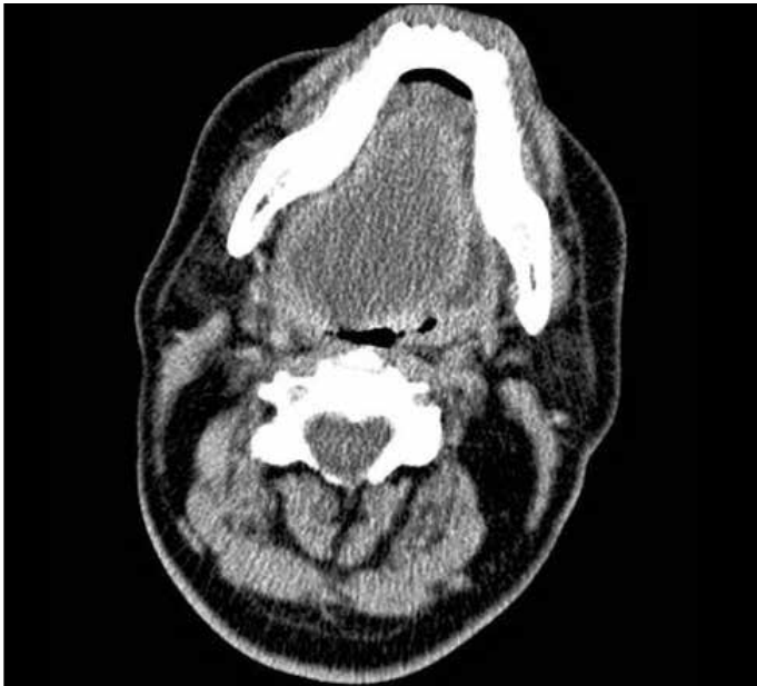
Figure 1. Computer tomography scan of the abscess