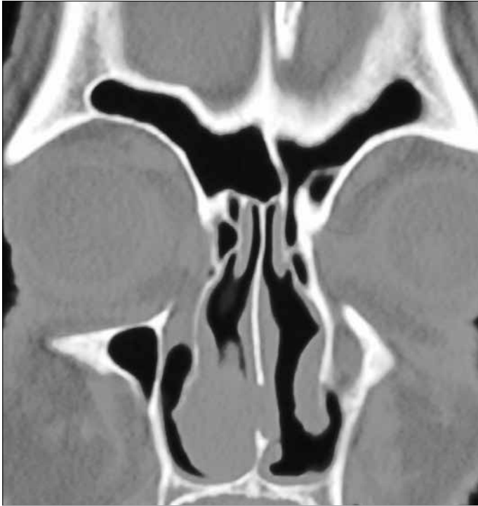
Figure 1. Paranasal sinuses are normal, with no signs of infection or polyposis in the paranasal CT CT: computed tomography