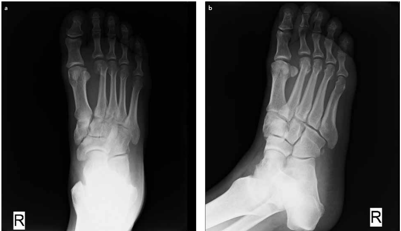
Figure 1. a, b. (a) Anteroposterior (AP) and (b) oblique X-rays showing the Lisfranc injury and metatarsal neck fracture

cuneiform; the central column is formed by the second and third metatarsals and the intermediate and lateral cuneiforms; and the lateral column consists of the cuboid and its relationship with the fourth and fifth metatarsals. In the coronal plain, the transverse arc of the midfoot is stable. Although many ligaments contribute to this stability, the most important contribution is that of the Lisfranc ligament between the medial cuneiform and second metatarsal; this is the strongest of these ligaments (4).