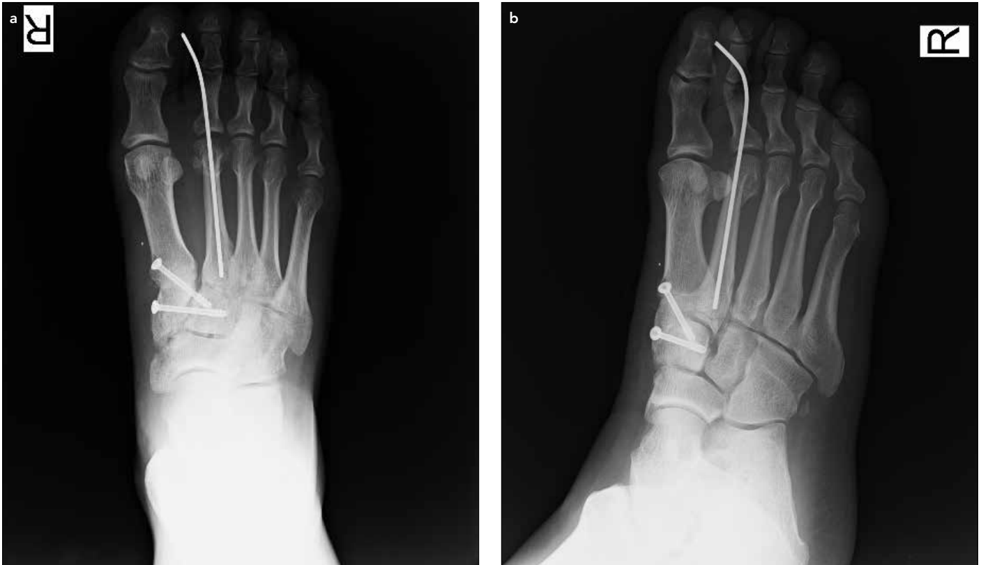
Figure 3. a, b. Fixation using two cannulated screws and a K-wire: (a) AP and (b) oblique radiographs

joint is luxated both proximally and distally, producing a “swimming metatarsal” (6). A Lisfranc injury accompanied by multiple metatarsal neck fracture-dislocations has also been reported (9). However, ours is the first reported Lisfranc injury accompanied by metatarsal neck fractures without luxation.