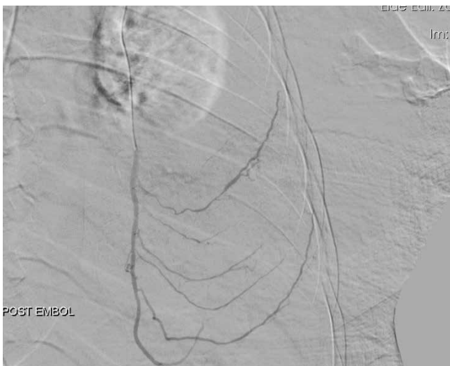
Figure 4. Postembolization DSA image of the IMA reflected devascularization of the tumor