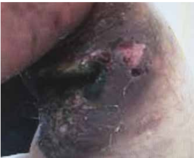
Figure 5. Complete hemostasis at the bleeding site

Another endovascular treatment method performed by interventional radiologists is the placement of a stent into vessels. Ugras et al. (10) achieved successful hemostasis in a patient with a catastrophic hemorrhage from a recurrent fungating axillary breast cancer via placement of an endovascular stent into the axillary artery. Surgical exploration was limited due to arm edema and decreased shoulder immobility in their patient. The authors later found an intimal disruption in the axillary artery under angiography as the probable origin of pseudoaneurysm, and then placed a covered stent across the defect under fluoroscopy.