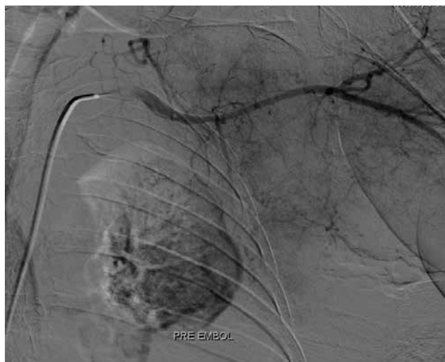
Figure 1. Preembolization DSA image acquired during left axillary artery run, giant hypervascular tumoral blush invading left upper part of thoracic wall

Nevertheless, owing to the skin involvement in LABC, severe bleeding from ulcerating and/or fungating lesions, especially in case of locoregional recurrence, can be seen more often. In these cases, TAE can be chosen a very practical and safe treatment option to control the bleeding instead of surgery, at which point an interventional radiologist should be called for this purpose. Embolization is an endovascular procedure that involves occlusion of arterial or venous structures with the aim of therapeutic outcomes. Interventional radiology has gained an increasing role in this field, particularly with respect to hemostasis for many advanced cancers of the body. A number of substances have been used as embolization agents, including gelatin foam, polyvinyl alcohol particles (PVA), tris-acryl gelatin microspheres, a number of