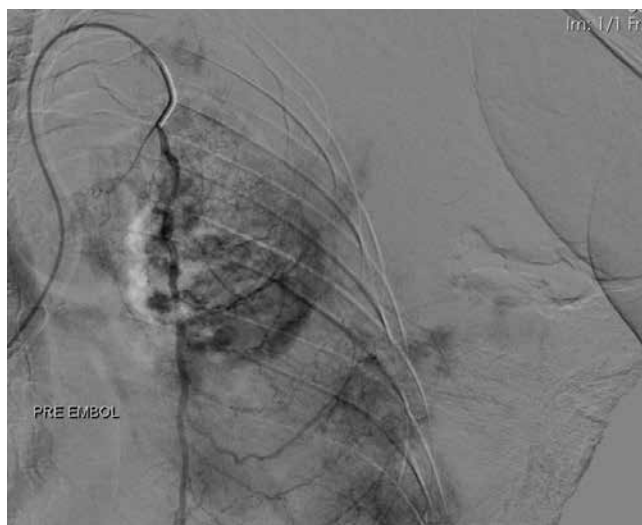
Figure 2. Preembolization DSA image acquired during internal mammary artery (IMA) run, hypervascular tumoral blush invading left anterior part of thoracic wall

various coils, detachable sack vascular occlusion devices, detachable balloons, amplatzer vascular plugs, n-butyl-2 cyanoacrylate, ethylene vinyl alcohol copolymer, calcium alginate gel, and absolute alcohol (6).