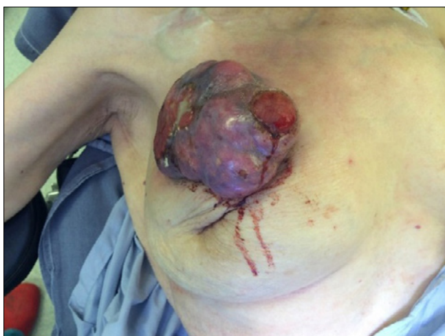
Figure 1. Preoperative image of the breast