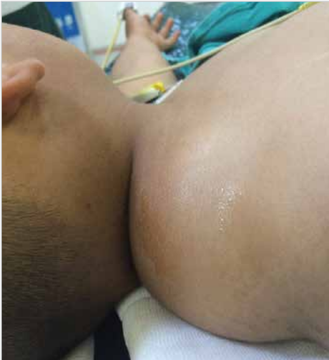
Figure 1. A well-circumscribed, multilobulated, 5×3 cm, immobile, non-tender, non-pulsatile, non-compressible, fluctuant, cystic in consistency mass in the right posterior cervical and supraclavicular regions