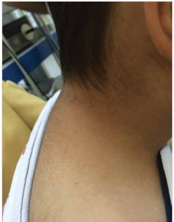
Figure 4. Physical examination at the third postoperative month revealing no recurrence

supraclavicular region (Figure 2), whereas the MRI scan showed a 63×52×40 mm, well-circumscribed, septated, cystic mass in the lateral border of SCM muscle superior to the clavicle and anterior to supraspinatus muscle suggesting a hemorrhagic LM (Figure 3). Use of bleomycin as a sclerosing agent for LM was approved by the General Directorate for Pharmaceuticals and Pharmacy of Turkey (75642246-518.01-E.154480). After taking informed consent from the parents, the patient was taken to the operating room. After induction of general anesthesia and endotracheal intubation, an 18G catheter was inserted under real-time US visualization. Approximately 60 mL of serohemorrhagic fluid was aspirated through macrocysts and 0.25 mg/