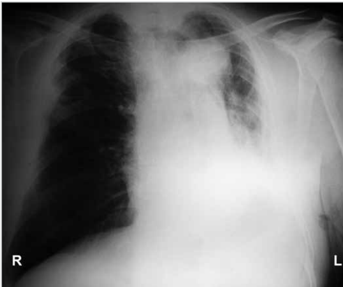
Figure 1. Chest X-ray showing hyperinflation of the right lung with complete collapse of the left lung and deviation of the trachea to the left

When TEPP is coughed out or swallowed, TEP has to be stented or a new prosthesis should be put in place as soon as possible. If stenting and/or replacement is not performed in a timely manner, TEP can easily get closed and the patient may require repeat TEP (5).