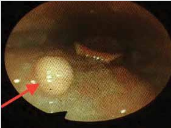
Figure 1. Endoscopic image of the mass in the posterior 1/3 of the tongue