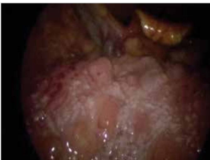
Figure 3. Endoscopic image of the patient in the postoperative 4 th month

is formed from normal bony tissue placed in an abnormal localization. Lingual osseous choristoma is seen in the age range of 5 to 73 years, particularly between the ages of 20 to 50, and the