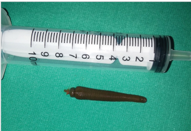
Figure 2. Live leech has been presented

anticoagulant properties. Furthermore, the saliva contains a histamine-like vasodilator that promotes bleeding, causing epistaxis, hemoptysis, or hematemesis (4).