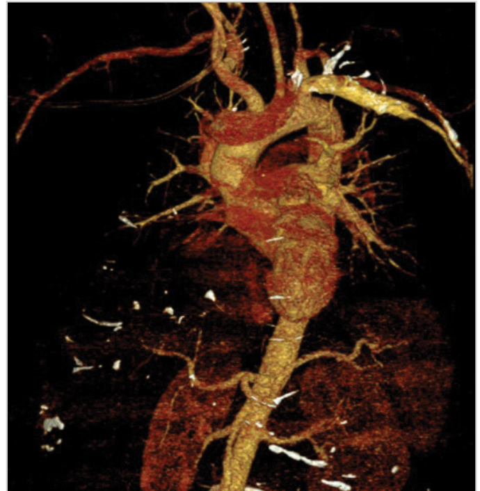
Figure 2. MR angiography. No aberrant subclavian artery accompanying NRLN was observed.

MR: magnetic resonance; NRLN: non-recurrent laryngeal nerve