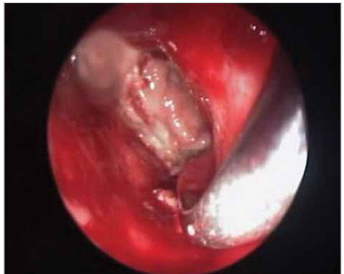
Figure 4. Nasal endoscopic examination revealing bone wax in the left frontal sinus

After routine analysis, the patient was informed about the procedure and her consent was obtained. She underwent left fronto-ethmoidectomy via transnasal endoscopic intervention under general anesthesia. At the beginning of surgical procedure, polypoid tissues in the left medial meatus were removed and a foreign body, which was considered to be the bone wax, was detected hanging down from the frontal recess of left medial meatus. It was observed that the foreign body extended to the frontal sinus and filled a substantial proportion of the sinus (Figure 4).