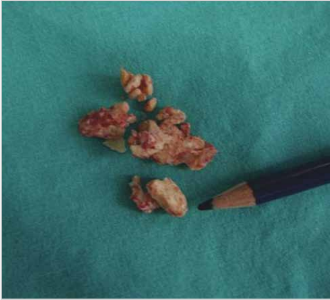
Figure 5. Surgical specimen

department and the method of obstruction with bone wax suggested that there might be a foreign body in our case. Providing hemostasis in bone is an important issue in neurosurgery. In 1892, Sir Victor Horsley defined bone wax method (Horsley Method) to provide regional hemostasis and stability in neurosurgery (12, 13).