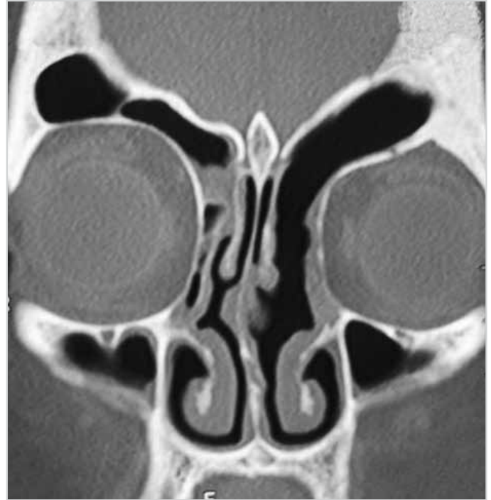
Figure 6. Postoperative 3rd month CT scan

Throughout the literature, in the present case report, we intended to highlight the facilities of approaching to the similar frontal sinus pathologies through nasal way using advanced surgical and imaging instruments during examination and cleaning of both the foreign body and pathological tissue and formations because such an approach is effective, has mini-