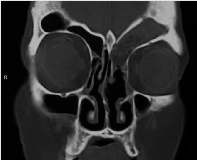
Figure 1. Preoperative coronal plane