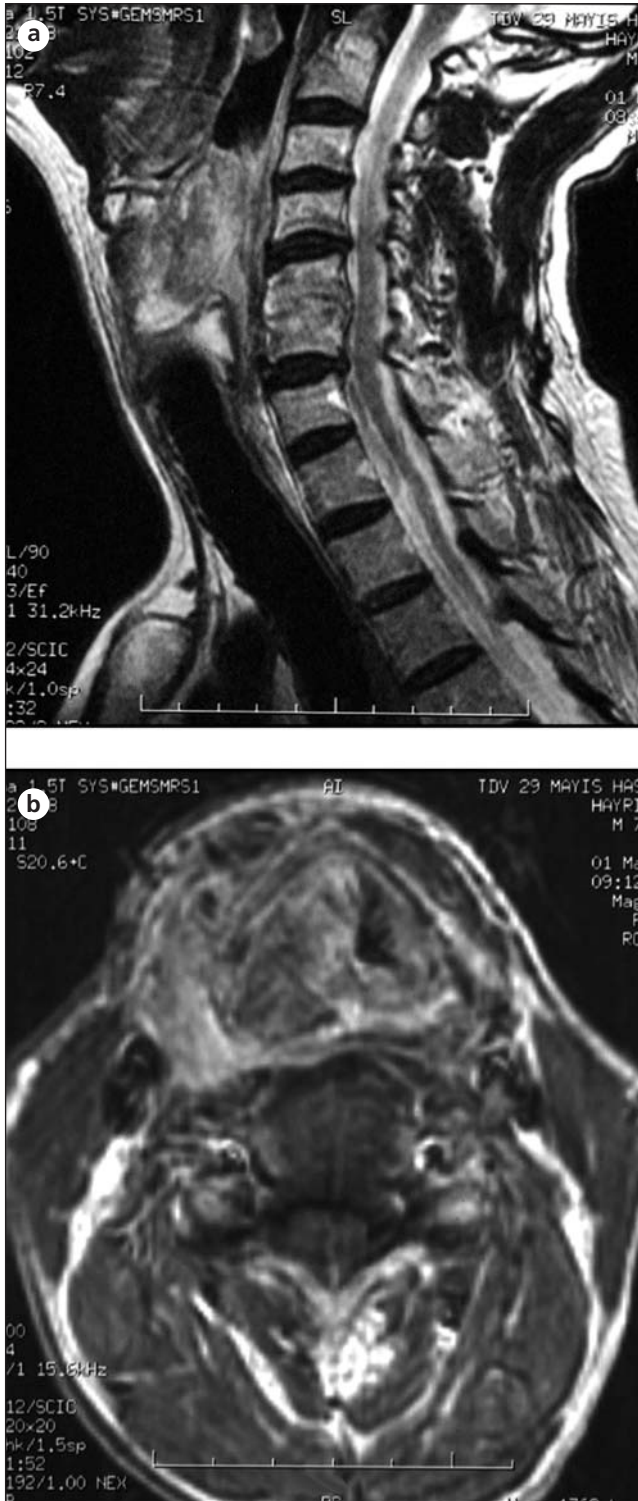
Figure 1. Sagittal (a) and transverse (b), T1 and T2 weighted MRI scans with contrast showed an infiltrative mass which filled up right hypopharynx and larynx.

also a rare laryngeal neoplasm. 2 Histological evidence indicates that human papilloma virus (HPV) has a critical etiological role in the progression of condylomatous lesion coexisting with laryngeal squamous cell carcinoma. 3