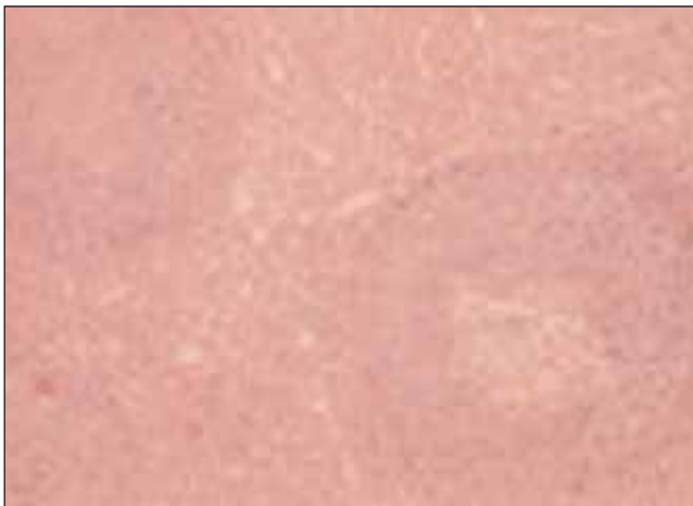
Figure 1. Prominent lymphoid and capillary proliferation. Lymphoid follicles have germinal centers (HE x100). [Color figure can be viewed in the online issue, which is available at www.turkarchotolaryngol.org ]

A 52-year-old female presented with recurrent oral cavity lesions for 5 years. There was a 3 cm x 2 cm lesion on the right buccal mucosa which had white patchy areas surrounded by erythematous, vascular tissue. The lesion had indistinct borders. The biopsy revealed suprabasal acantholytic cells, capillary proliferation and lymphoplasmocytic inflammatory cell infiltration forming lymphoid follicles lying beneath the stratified squamous epithelium. The lymphoid follicles had germinal centers. There were lysis of follicles, rich eosinophilic infiltration, lymphoid hyperplasia and fibrosis. The perivascular wall was proliferative and endothelium was oedematous. Neck examination revealed no lymphadenopathy. The patient had no systemic disease involvement. History revealed no etiologi-