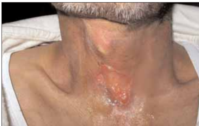
Figure 3. Photograph showing the wound on the 13th postoperative day. [Color figure can be viewed in the online issue, which is available at www.turkarchotolaryngol.org ]

unds the neck site (Figure 2). Broad-spectrum antibiotic coverage was instituted until cultures from wound and blood were obtained. Intravenous antibiotic treatment consisting of and intravenous rehydration was started immediately. Wound and blood cultures both revealed group A -hemolytic streptococcus as the offending organism. In antibiogram study, isolated pathogen was found to be sensitive of the amoxicillin/clavulanate potassium.