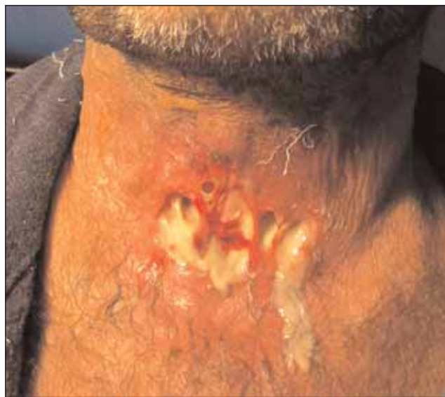
Figure 1. Photograph showing the wound in the anterior neck region. [Color figure can be viewed in the online issue, which is available at www.turkarchotolaryngol.org ]

On examination he was alert and oriented. Surface temperature was 38.3°C, blood pressure 106/64 mm Hg, pulse 146/min, and 24/min respirations. Examination of the neck revealed red-blue, blistering swelling below both sides substernally. In the anterior neck region there was superficial necrosis