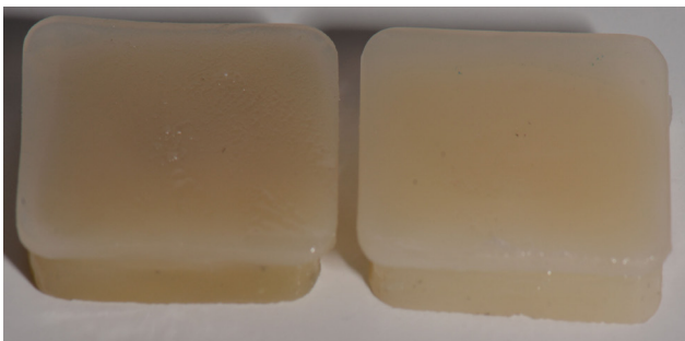
Figure 1. Resin cements were carried out onto dark and light background according to the manufacturer's instructions

According to a pilot study, for a power analysis with a 0.05 level and 80% power the required minimum sample size was n=40 . Statistical analysis was performed using SPSS 19.0 for Windows software (SPSS Inc., Chicago, IL, USA). The Shapiro-Wilk test was used to determine normality, and the test results showed that the data were not distributed normally therefore Kruskal-Wallis was performed. The Mann-Whitney U test was performed to determine whether color differences were significantly different between each group. The significance level was set at p<0.05 ( p<0.05 ).