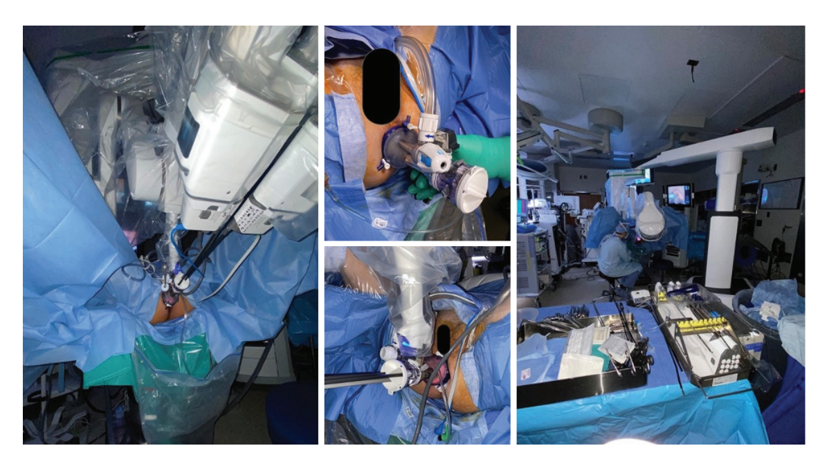
Figure 2. Single port robot (SP DaVinci Robot) and use of Endorobotics

With the development of novel, fully flexible, robot-assisted surgical systems, there may soon be significant progress in the current understanding of ELS. These platforms might enable surgeons to perform incisionless surgeries through the gastrointestinal wall, that previously could only be performed via transabdominal surgery.