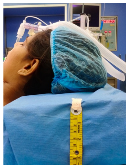
Figure 1. (Group B) NGT insertion in additional flexion of the neck.

In Group A, NGT was inserted while the patient’s head is in the standard sniffing position. In Group B, additional flexion of the neck was used by placing a non-compressible 10 cm width pillow under the patient’s head (Figure 1). In Group C, NGT was inserted while the patient’s head was in the standard sniffing position with applying lateral neck pressure on the same side of the selected nostril (Figure 2). Lateral neck pressure was applied with three fingers placed about an inch lateral to the trachea, at the level of the cricoids cartilage. The successful placement of NGT was confirmed by auscultation at the epigastrium during which a characteristic whooshing sound was heard by injecting 20 mL of air fast into the NGT-called the whoosh test. The time for insertion (seconds) was started from NGT insertion through the selected nostril up to the successful placement of NGT within a maximum of two attempts which includes cleaning and re-lubricating the NGT in case of first attempt failure. If both attempts failed, then the technique was considered a failure, and an alternative technique was used. The following observations were documented: a number of attempts for successful insertion of NGT, time for insertion of NGT, and complications like kinking, coiling, and bleeding (Figure 3).