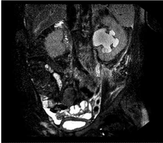
Figure 1. MR urography: Ureteral suspicious mass in the middle part of the left ureter with hydronephrosis