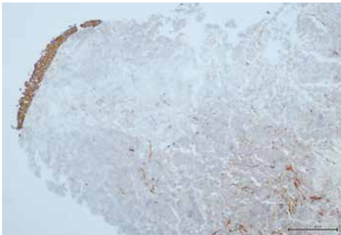
Figure 3. There was no staining observed with CK-7 in malignant cells (x10)

Histopathology revealed atypical epithelial cells with large vesicular nuclei and with prominent nucleoli. Central necrosis and high mitotic activity was also reported in tumour clusters. CK20 Immunohistochemistry (IHC) examination of tumour cells revealed diffuse and strong cytoplasmic staining pattern